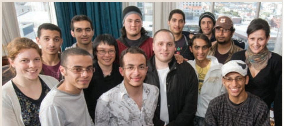
Celebrating a year's hard work—Victoria's Saudi Arabian students and support staff

"In a way, these students are pioneers. They are the first students from Saudi Arabia we've had here at Victoria and it's an incredibly challenging process for them. They're under a